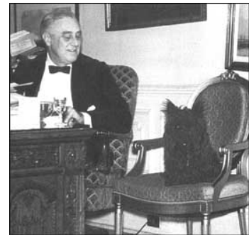
FDR and Fala in Oval Office

As the invited guests gathered round, it was as quiet as a church in the study-not a whisper, the only sound came from Fala who was stretched out sleeping heavily-oblivious of the momentous happenings." 5