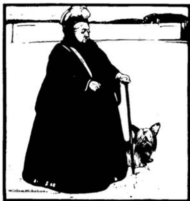
Queen Victoria and a Skye Terriers

More importantly, Queen Victoria became familiar with the dogs of Scottish lowlands during her frequent travels to her castle in Scotland with her beloved husband Prince Albert. A dog lover all her life, she fell in love with the dogs of the Scottish moors and added them to her expansive kennels in Scotland and England. Upon the death of Prince Albert in 1861, the Queen took to seclusion preferring to surround herself with canine companions. It was at this juncture, the Scottish Terrier like other notable canines of the period became companions of the court, rather than mere barnyard servants. She raised in her lifetime more than 15 different breeds of canine, notwithstanding Skye Terriers and Scottish Terriers. Her favorite Scot was named Laddie.